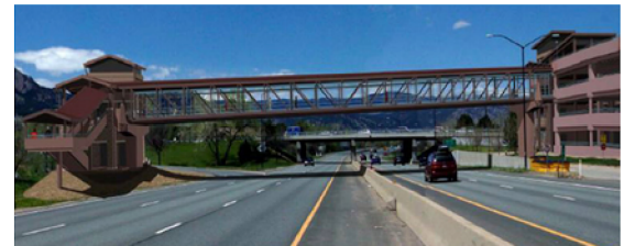
Table Mesa Pedestrian Bridge, Denver, CO

Dowco Consultants specializes in steel & concrete detailing services for bridges and commercial / industrial structures, full connection design services, 3D modeling, Building Information Model (BIM) consulting, 3D model management, workflow consulting and much more. Dowco also has a team specialized in building Structural BIM models for coordination and integration with Mechanical, Electrical and Plumbing (MEP) teams.